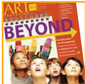
Receive $50+ in subscriptions!

Connect with visual arts education professionals from across the country and receive exclusive benefits that can stimulate your career, your classroom, and your creativity.