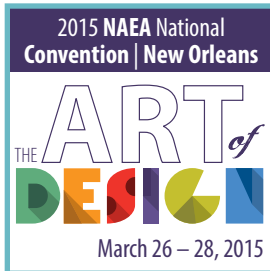
National Convention discounts!