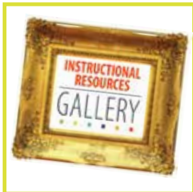
Access exclusive lesson plans!